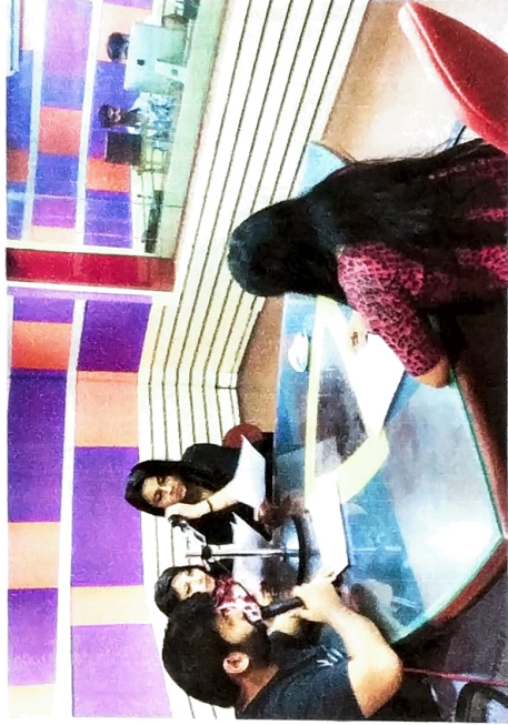
AUDIO PRODUCTION LAB