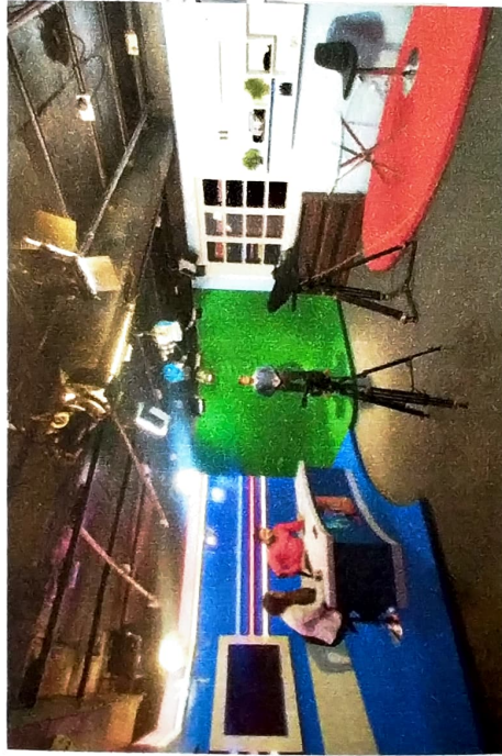
VIDEO PRODUCTION LAB