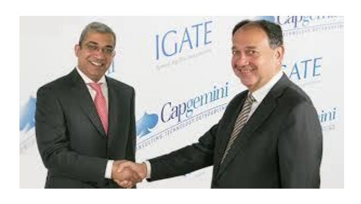
French IT giant Cappemini bought Igate for $48 a share and the combined entity would have 12.5 billion euro in revenues!

Top News Capgemini buys Igate for $4.04 billion